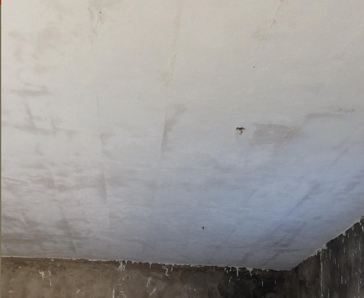
Casted top roof slab