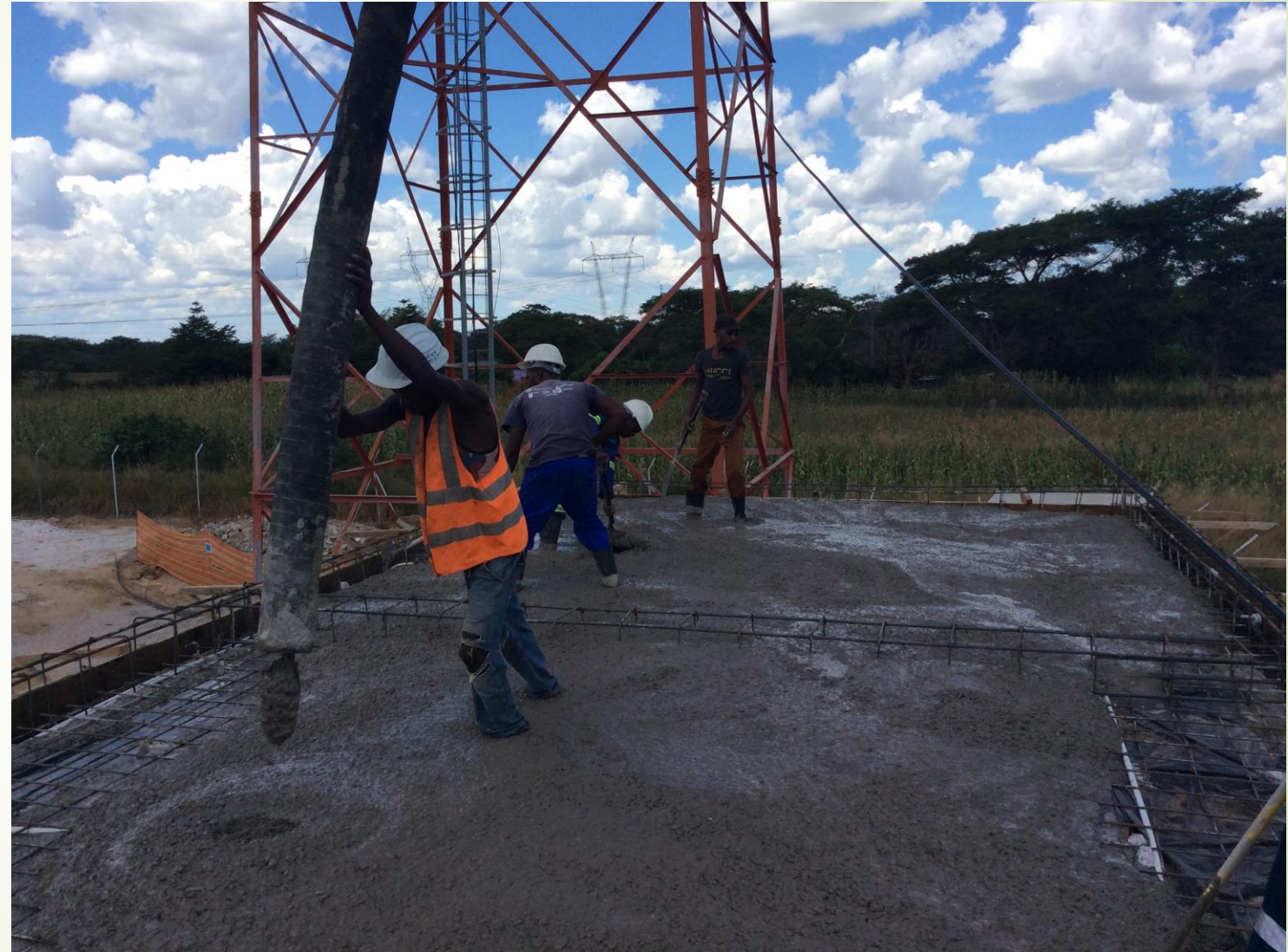
Casting Roof top slab