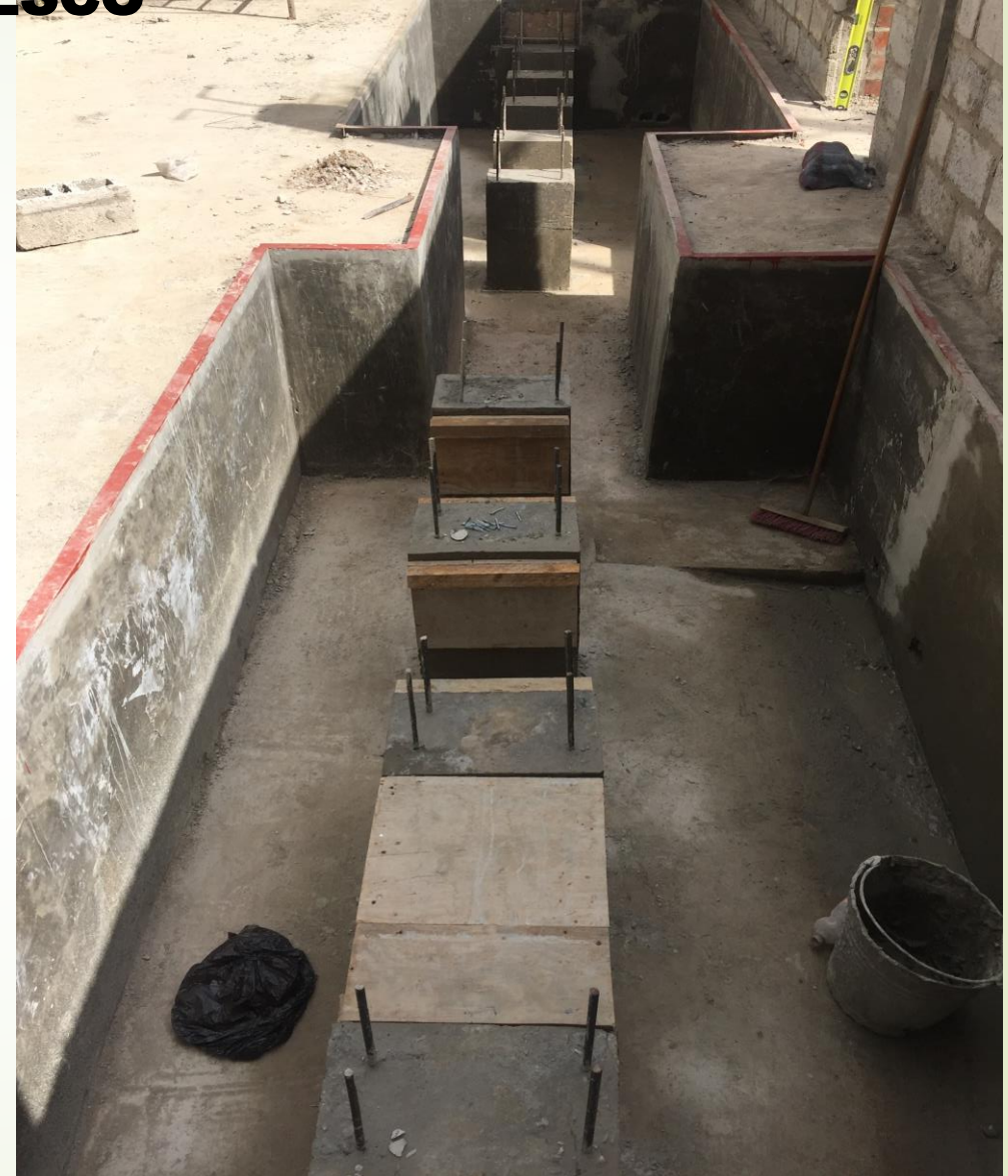
Inside Cable trench