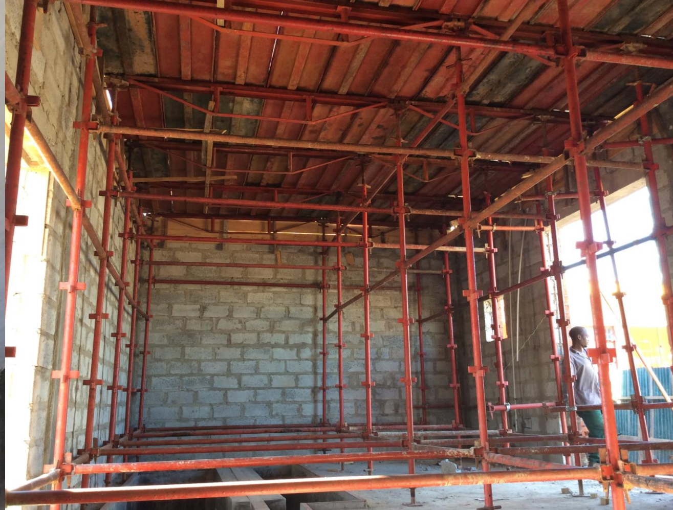
Steel shutters For top roof slab