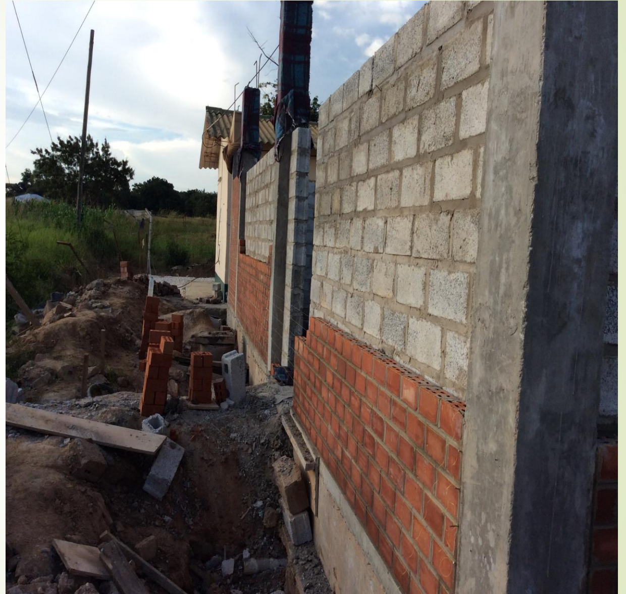
Brick to block wall