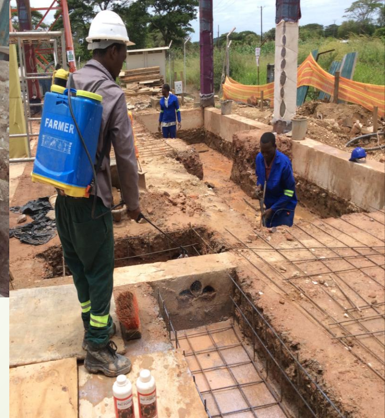
Applying termite killer