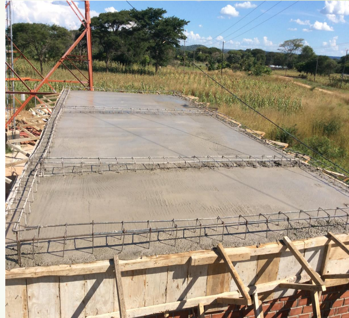
Roof top slab