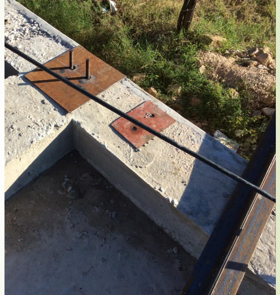
Roof beam slab