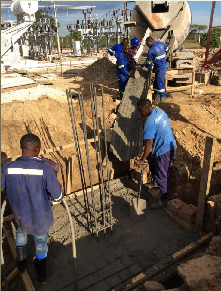
Premixed concrete pouring